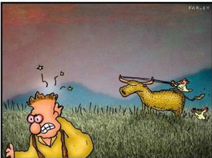
More unusual examples of animal symbiosis